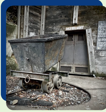
GOLD BUG PARK & MINE